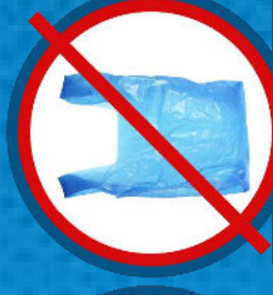
Plastic Bags & Film*