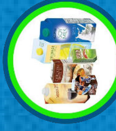
Food & Beverage Cartons

Keep items loose, clean & dry. Always flatten your cardboard.