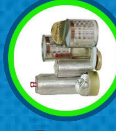
Metal Food & Beverage Cans