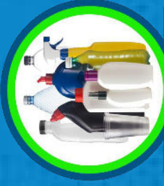
Plastic Bottles & Containers