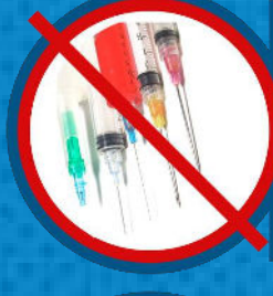
Sharps & Needles